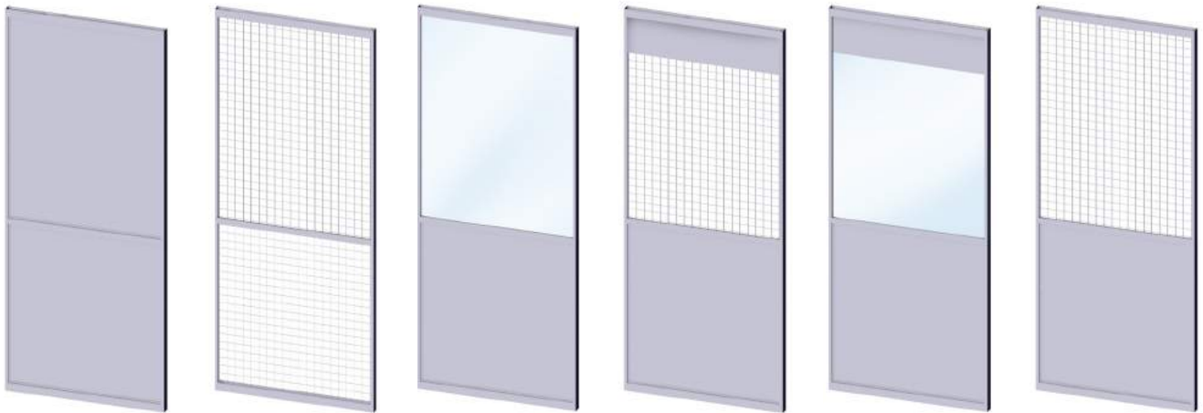
Sigma Solid Steel